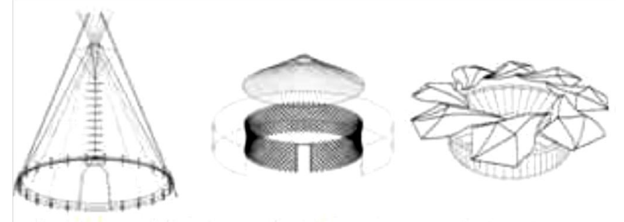
Figure (2)Kinetic architectural structures with centric configuration (21)