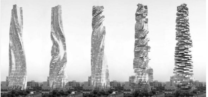
Figure (3)The movement of the structure in the Dynamic Tower in Dubai(10)

5-1-2 Internal movement : The applications of internal movement are numerous and can be classified into categories: